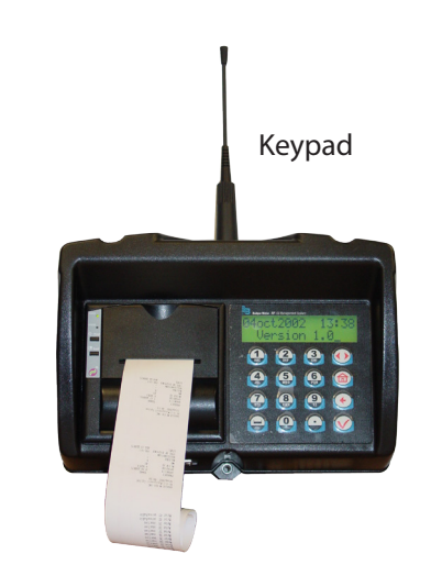
Up to 30 RF Meters per Keypad