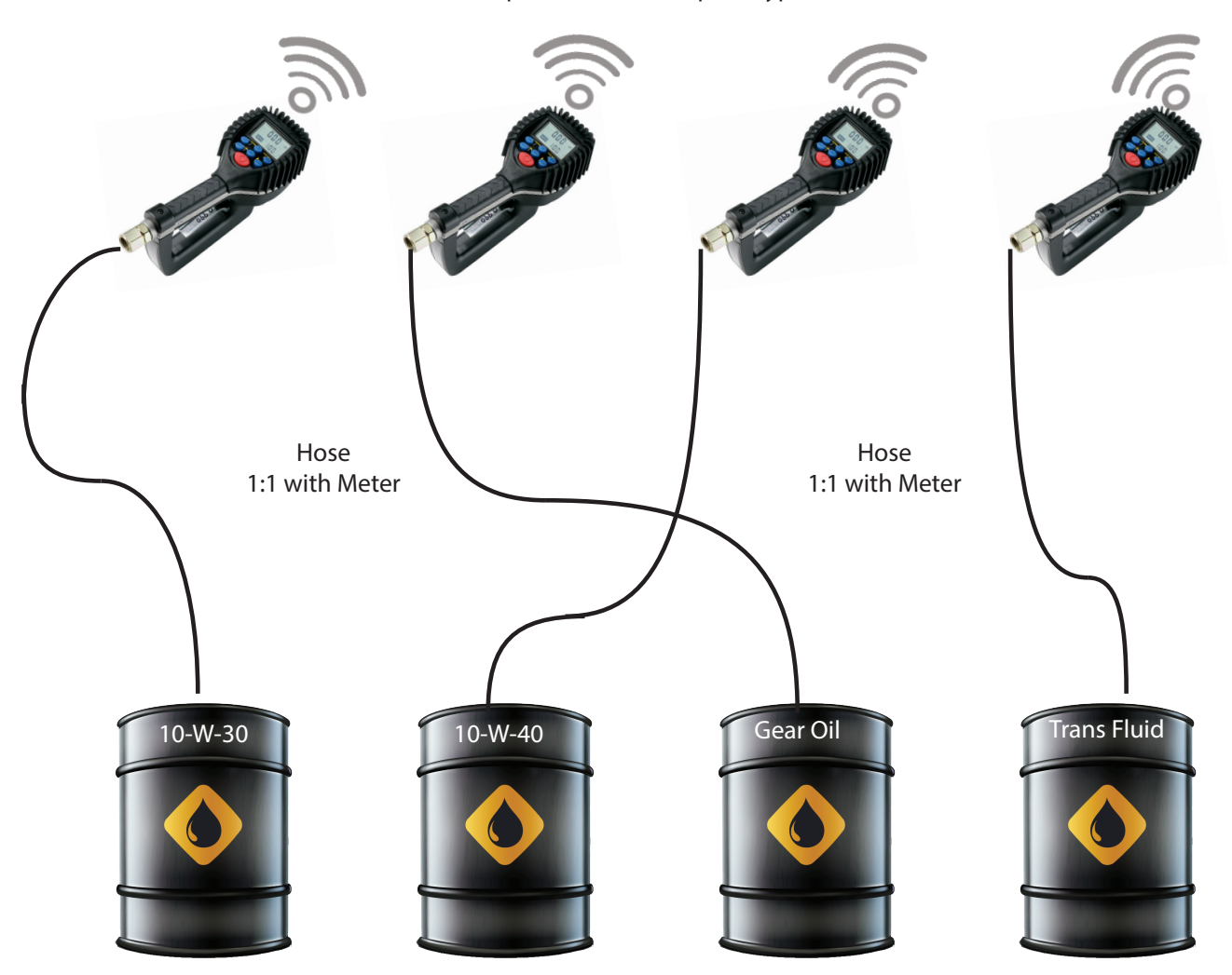
Up to 8 Fluid Types and 8 Tanks per Keypad